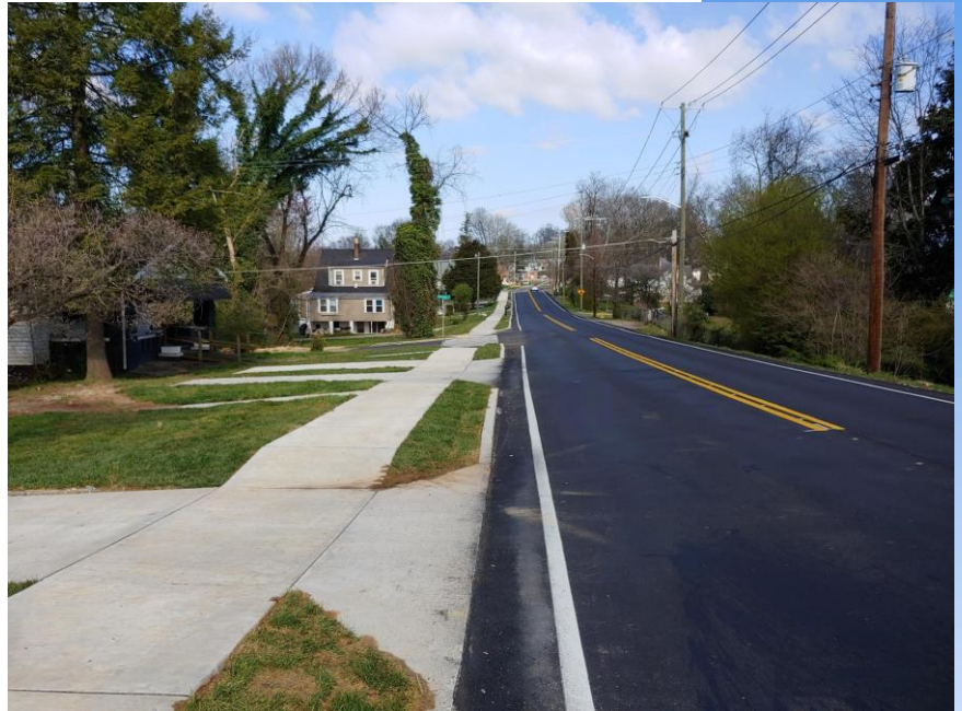
213 S Castle Street Looking North – Construction Complete

Project Description: The City previously received Federal Congestion Mitigation and Air Quality Grant (CMAQ) grant funding to provide design, right-of-way and construction for this project with an 80/20 match for all the phases. The project includes approximately 1,300 linear feet of sidewalk along South Castle Street from Martin Luther King Jr. Avenue to the entrance of Claude Walker Park.