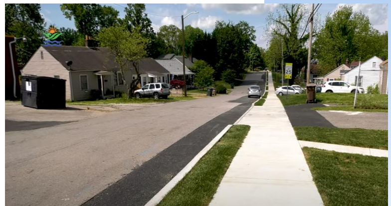
Construction Complete - May 2022