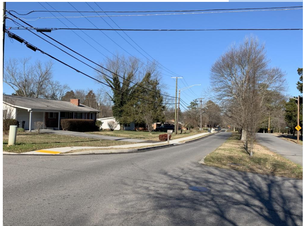
January 2020 – Construction Complete