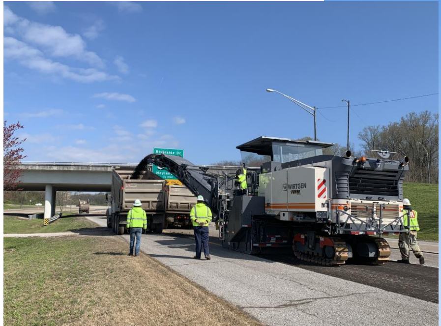
Milling and Resurfacing Activities at James White Parkway

The list of streets to be resurfaced may be added to or deleted from as may be determined by the Engineer within the time frame of this contract.