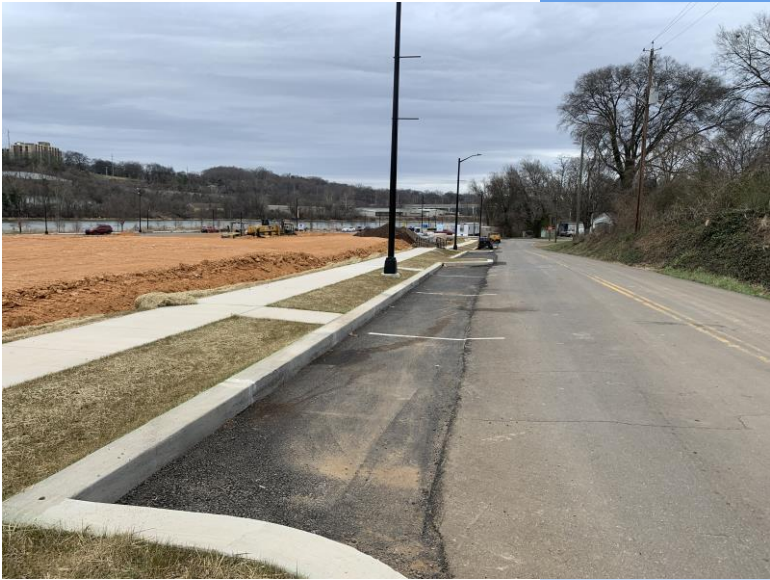
Langford Avenue – Looking East February 2022

Project Description: The City of Knoxville has allocated capital funds to develop the roadway connections between Langford and Waterfront Drives near Suttree Landing Park with the intent to provide for the construction of roadways, drainage systems, curb lines, sidewalks, and certain public utilities. The City has previously engaged Fulghum MacIndoe & Associates to provide construction plans and specifications for the construction of these improvements. The City issued this Invitation to Bid for the construction of the connections for Empire and Dixie Streets between Langford and Waterfront Drives. The remaining connections for Claude Street and Barber Street will be undertaken as funding becomes available to complete this roadway set.