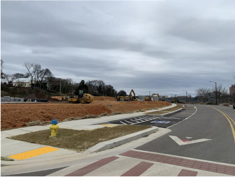
Waterfront Drive – Looking West February 2022

Schedule: Bid Opening: January 27, 2021 Notice to Proceed: May 17, 2021 Contract Completion Date: November 12, 2021