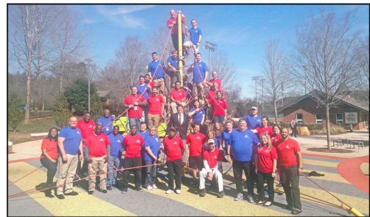
City Parks and Recreation Staff