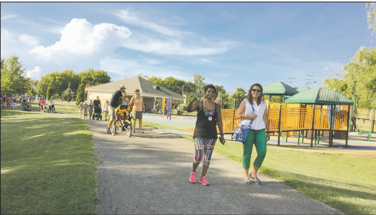
Neighbors arrive at the Ashley Nicole Dream Playground in Caswell Park after walking from their neighborhood with City leaders in the inaugural Neighborhoods to Nature event in Summer 2016.