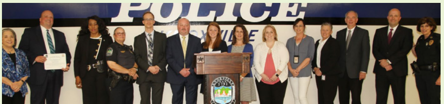
Read more about the Special Crimes Unit Award

Unit Awards were presented to the Special Crimes Unit and to the Safety City team.