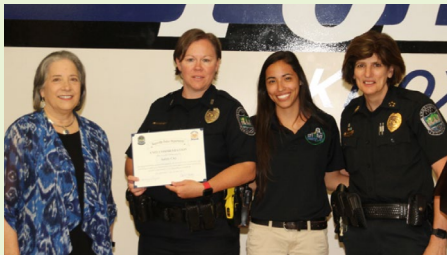
Read more about the Safety City Unit Award

Unit Awards were presented to the Special Crimes Unit and to the Safety City team.