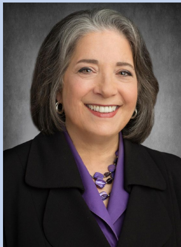
Mayor Madeline Rogero

Welcome to the summer edition of City Works!