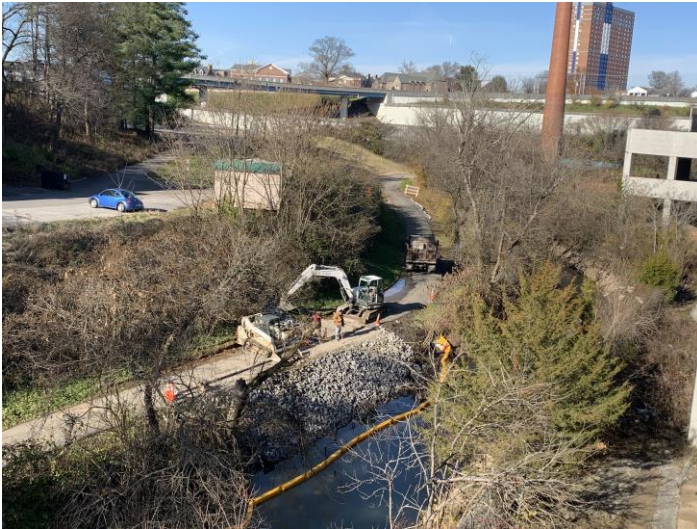
During Construction - December 2020