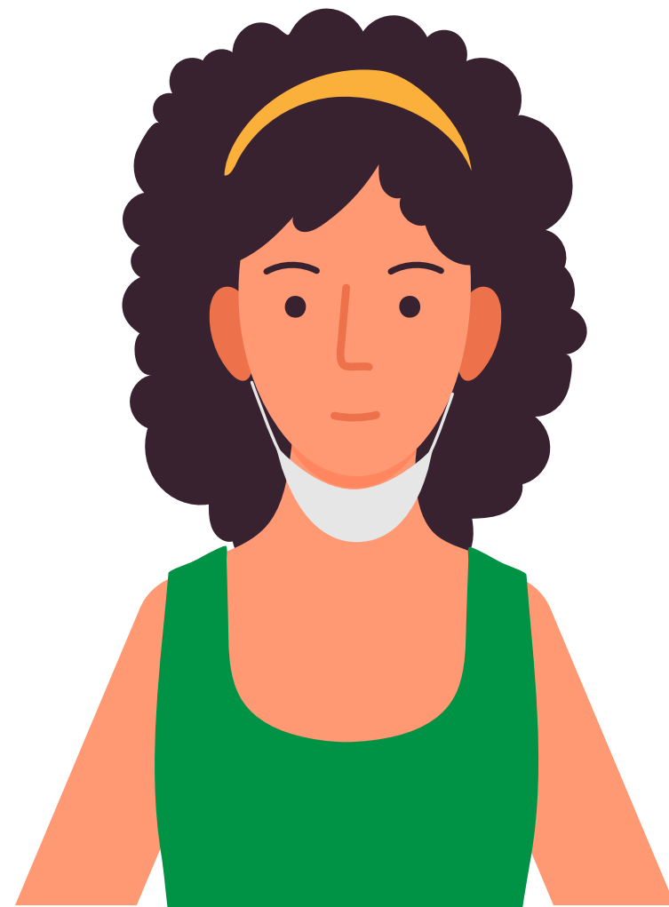
NOT COVERING NOSE OR MOUTH