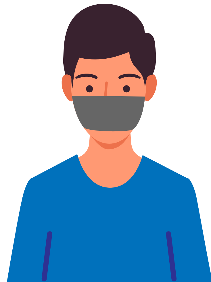
NOT COVERING CHIN