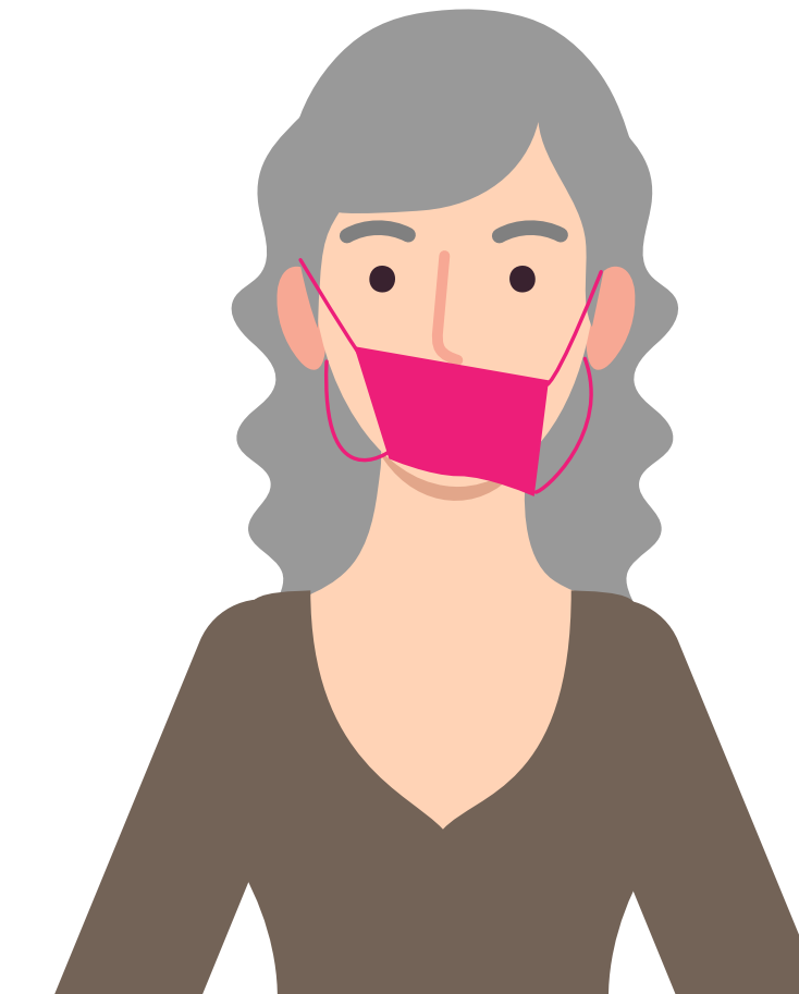
LOOSE OR ILL-FITTING MASK