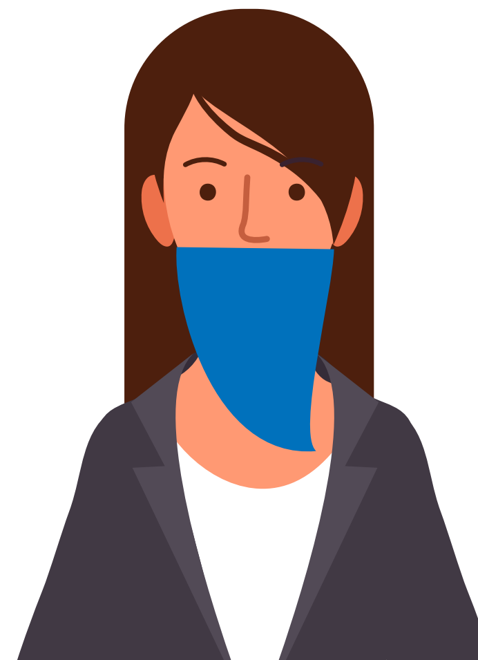
NOT COVERING NOSE